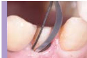
Backside surface for inserting more part of cord.