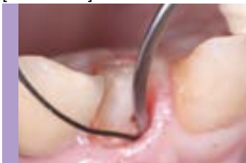
Outside surface for inserting the edge of cord.