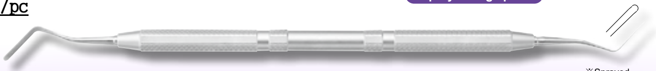
Gingival Cord Packer #0.3 for Posterior T/C No.13110