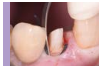
Inside surface for the narrow space such as the space between the teeth.