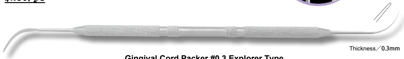
Gingival Cord Packer #0.3 Explorer Type No.13100